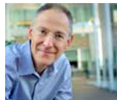
Dr. Ezekiel Emanuel

The Hamline Law Dean's Dinner featuring Dr. Ezekiel Emanuel welcomed 250 guests and was held on Thursday, November 21, 2013 at Muse Event Center in Minneapolis. From February 2009 to January 2011, Dr. Emanuel was a special adviser for health policy to the White House Office of Management and Budget. As one of the most prominent voices advising the White House about health care, he had a significant impact on federal health care budgets and the Affordable Care Act. Today, Dr. Emanuel holds a joint position at the Wharton School and the School of Medicine at the University of Pennsylvania, where he chairs the Department of Medical Ethics & Health Policy.